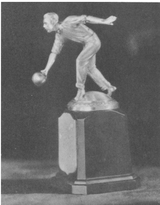
Nuchar Trophy, won by American Maize Products Company AMAIZOS.