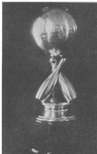
American Oil Chemists' Championship Trophy, won by Swift Premium Team.